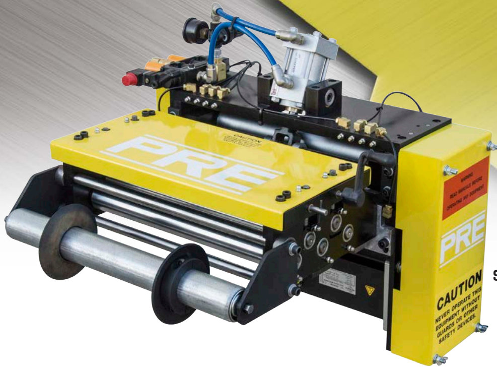
P20 Series Servo Feed with Pull Through Straightener

PRE Electronic Servo Driven Roll feeds are low maintenance, high precision machines. The rigid, compact design and precision keyless drive components coupling the servo motor and drive rolls ensure accurate, repetitive feed lengths. PRE press room equipment - longtime proven performers.