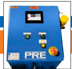
P20 Standard Duty Console