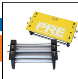
Pull Through Straightener Options