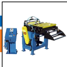
P325 Series Servo Feed with Pull Through