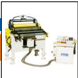
P450 Series Servo Feed

Many options are available: (see following pages)