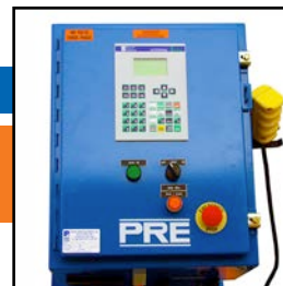
P20 Heavy Duty Console