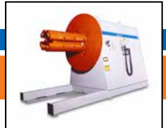
20,000 lb Single Arbor Non-Motorized