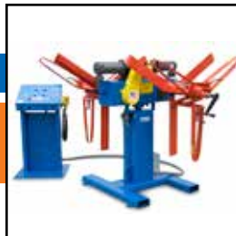
1,500 lb Double Arbor Motorized