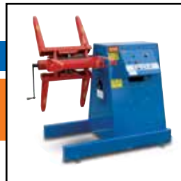
6,000 lb Motorized