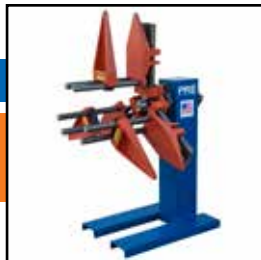
600 lb Non-Motorized